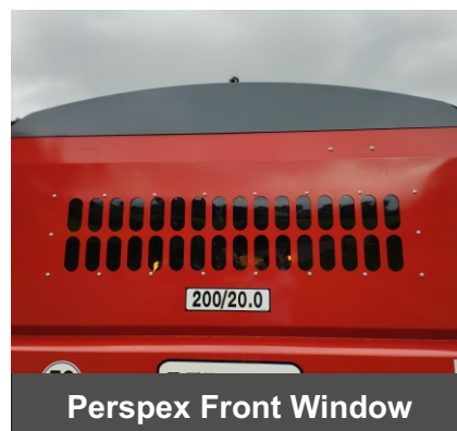
Perspex Front Window