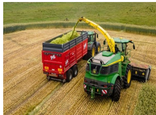
220/22.0 Silage Trailer