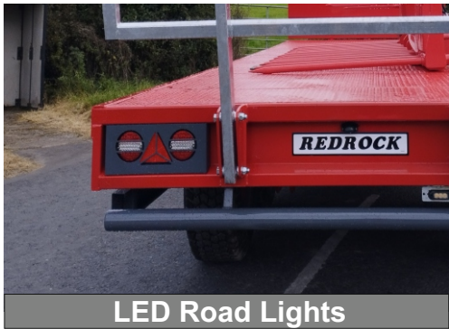
LED Road Lights