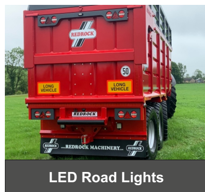
LED Road Lights