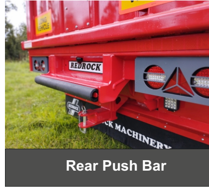
Rear Push Bar

Redrock trailers are fitted with high speed commercial axles as standard with 420 x 180 brakes giving approx 50% braking efficiency. The Road Vehicles (construction and use) Regulations 1986 requires trailers to have minimum of 25% braking efficiency at speeds up to 32kph. Above 32kph, the braking efficiency minimum is 45% and failsafe brakes or ABS should be fitted.