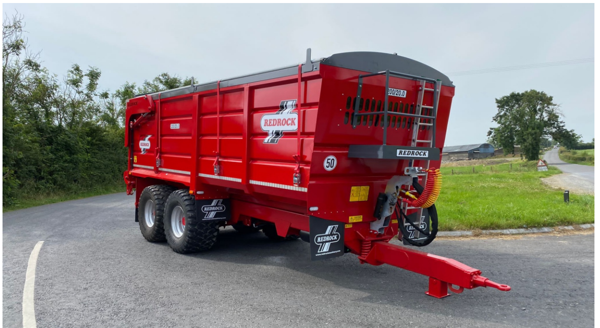
200/20.0 Grain Trailer with Roll Over Cover