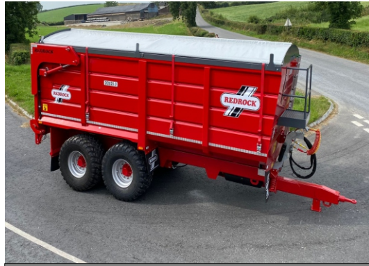
Roll Over Cover Sheet