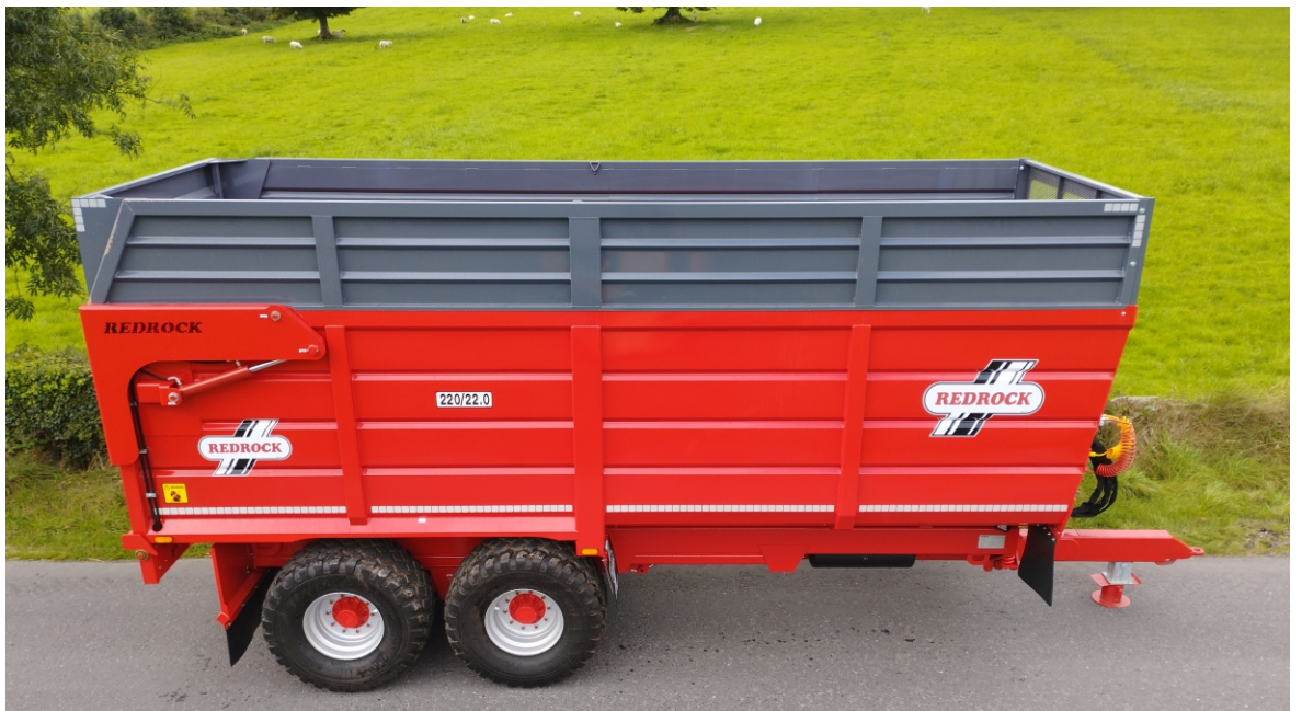
200/20.0 Silage Trailer