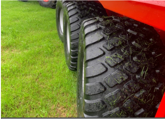
Rear Steering Axle