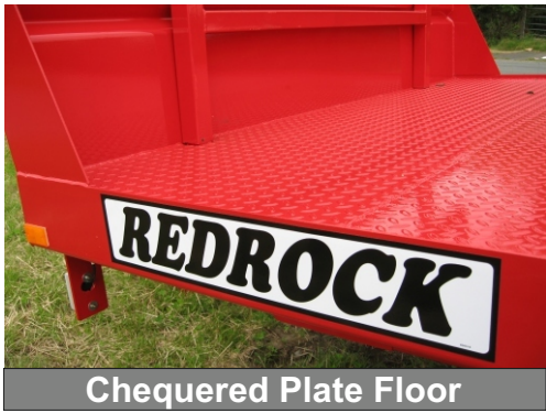
Chequered Plate Floor