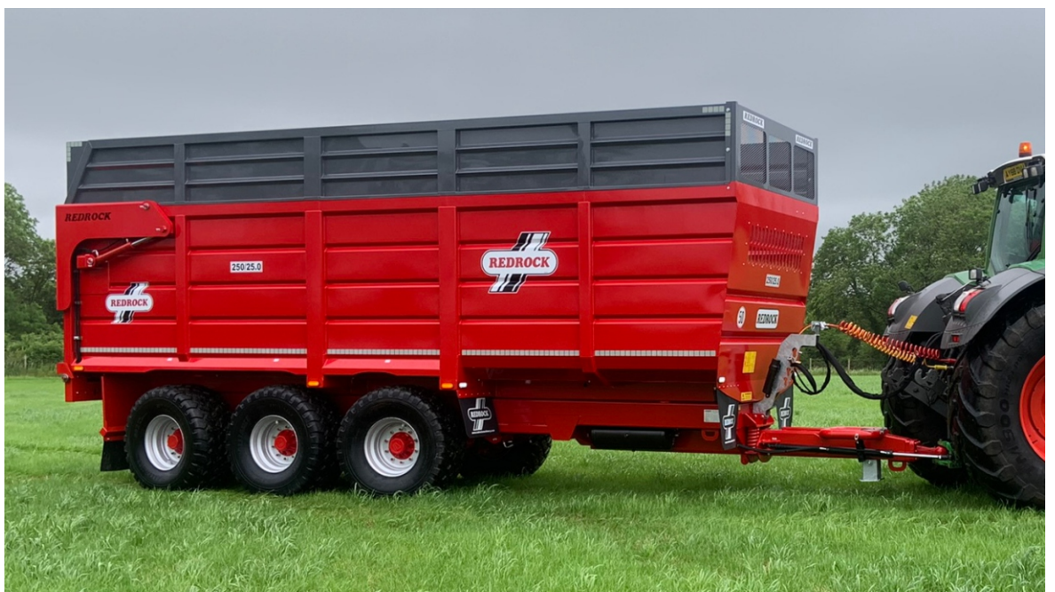
250/25.0 Silage and Grain